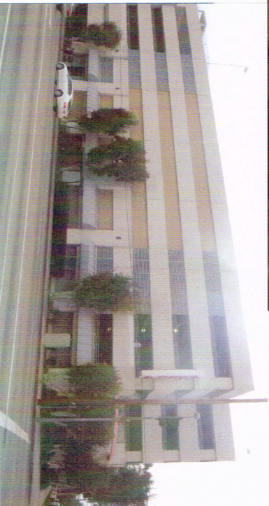
17. View looking west across the intersection of Hatteras Street and N. Sepulveda Blvd. at the 8-story office building (right) and 6-level parking structure (left).